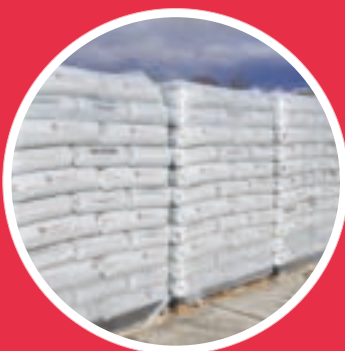
25 KG BAGS ON PALLETS